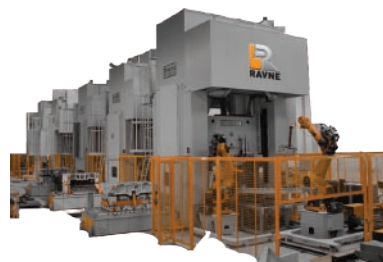
RAVNE TANDEM LINES