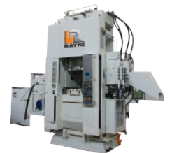
RAVNE PRECISE CUTTING