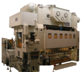
RAVNE TRANSFER PRESSES

One operator change dies. Extreme productivity increase. Simple & Low cost operation. Solution for any size of press or die. The same equipment for different die sizes.