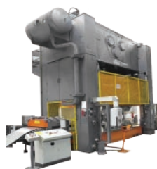
RAVNE PROGRESIVE DIE PRESSES